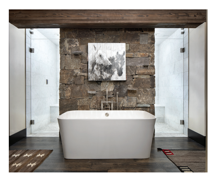
In the master bath, a freestanding white porcelain tub is set against the rugged, vintage stone that frames the marble shower room. Native American rugs and a contemporary horse painting, A Pair by Matt Flint, further elevates the melding of old and new.

Throughout the building process, everyone involved,