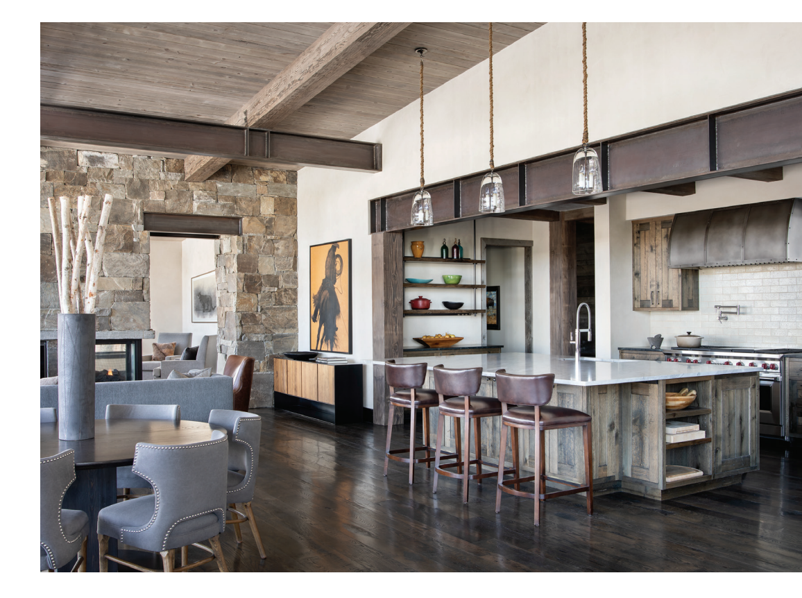
FROM TOP: The kitchen island provides plenty of space for cooking or casual dining. The ochre in the painting Barrido by Duke Beardsley provides a strong visual in the living area that's otherwise commanded by natural stone, wood, and a color palette reminiscent of the Montana landscape. • The ski room features radiant-heat concrete floors with boot warmers, space to hang helmets and gloves, and lockers made of reclaimed wood.

the neighborhood. "We were thinking rustic timeless, but we wanted an up-to-date contemporary look," Matt says. They weren't far into the design phase when they came up with the term that best described what they were looking for: "Business up front, party in the back."