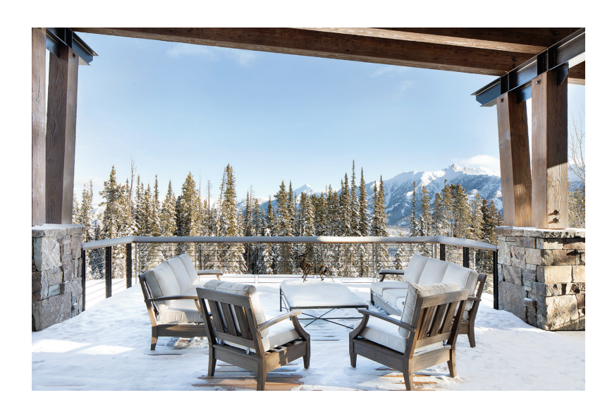
The back deck, which offers expansive mountain views, features a mix of local Montana stone and wood, applied with clean lines and minimal detail to create a modern rustic aesthetic.

The main entrance to the house features an oversized wood door of hand-hewn timber slabs flanked by glass panels. Guests then pass under an elevated steel bridge that leads to the top floor childrens' bedrooms and a common work/ play space. The open living space on the main floor opens up dramatically upon entering the great room/dining/kitchen area. There, large glassed volumes and a soaring ceiling are