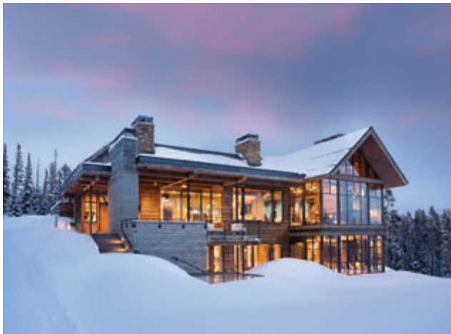
Serenity surrounds this family-friendly retreat, built with a reverence for nature, including seasonal landscaping by Design 5 Landscape Architecture.

While a ski-in retreat surrounded by snow-covered open space sounds especially idyllic when much of the rest of our lives has migrated online, one local family laid the foundation for this timely dream long before our new normal set in.