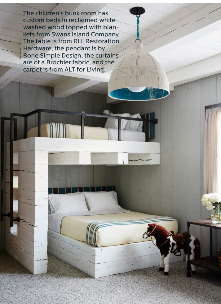
The children's bunk room has custom beds in reclaimed white-washed wood topped with blankets from Swans Island Company. The table is from RH, Restoration Hardware, the pendant is by Bone Simple Design, the curtains are of a Brochier fabric, and the carpet is from ALT for Living.