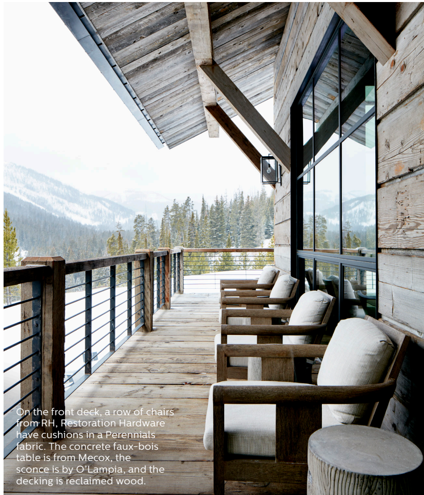
On the front deck, a row of chairs from RH, Restoration Hardware have cushions in a Perennials fabric. The concrete faux-bois table is from Mecox, the sconce is by O' Lampa, and the decking is reclaimed wood.