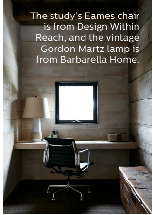
The study's Eames chair is from Design Within Reach, and the vintage Gordon Martz lamp is from Barbarella Home.