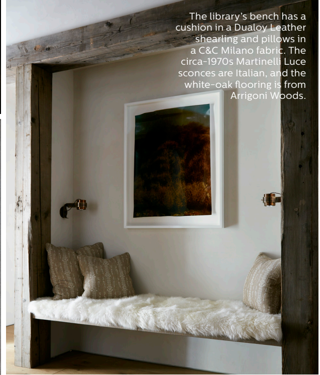
The library's bench has a cushion in a Dualoy Leather shearling and pillows in a C&C Milano fabric. The circa-1970s Martinelli Luce sconces are Italian, and the white-oak flooring is from Arrigoni Woods.