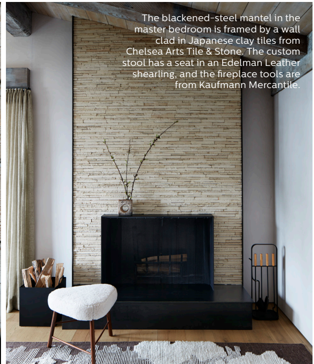
The blackened-steel mantel in the master bedroom is framed by a wall clad in Japanese clay tiles from Chelsea Arts Tile & Stone. The custom stool has a seat in an Edelman Leather shearling, and the fireplace tools are from Kaufmann Mercantile.