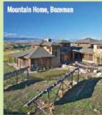
Mountain Home, Bozeman

This architect designed the first LEED for Homes-rated residence in the state of Montana (Gold) and another that is awaiting certification.