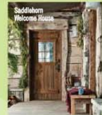
Saddlehorn Welcome House

LEED projects include the Missoula Federal Credit Union Russell Branch, the first new construction Platinum under construction in Dillon, Montana, and on-track to be the first LEED-certified Hospital in Montana.