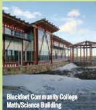
Blackfeet Community College Math/Science Building