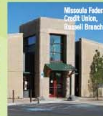
Missoula Federal Credit Union, Russell Branch

CTA currently has over 50 projects registered with the LEED program including 21 that have been certified, including the LEED Platinum MET Transfer Center.