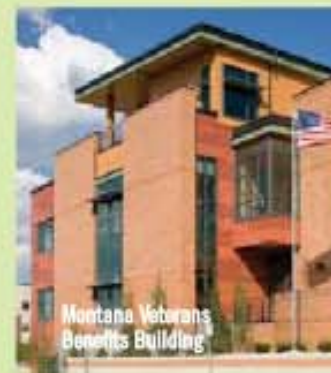
Montana Veterans Benefits Building

LEED projects include a family camp with barn and a rustic cabin that received Platinum and another home submitted for LEED Certification in April 2011.